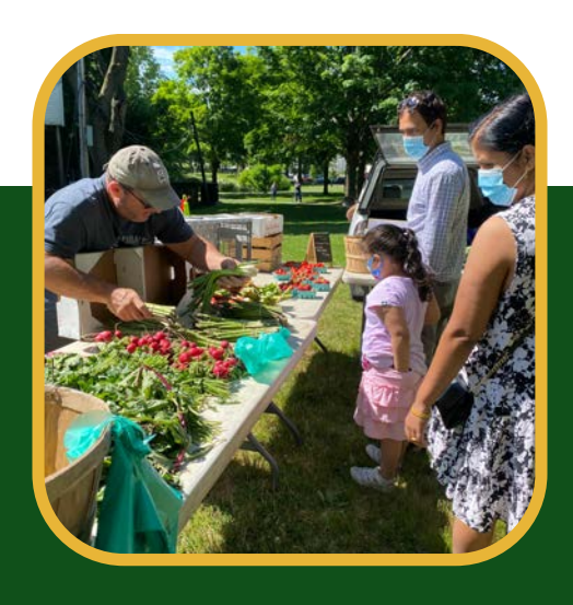
REC Standing and Mobile Farmers Markets

We support a network of over 70 community and school gardens and 600 gardeners across Worcester. Support includes seedling distribution, compost deliveries, garden signage and more.